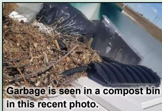
Garbage is seen in a compost bin in this recent photo.

Current global markets dictate that recycling streams must contain little to no commingling. Some recycling companies will refuse